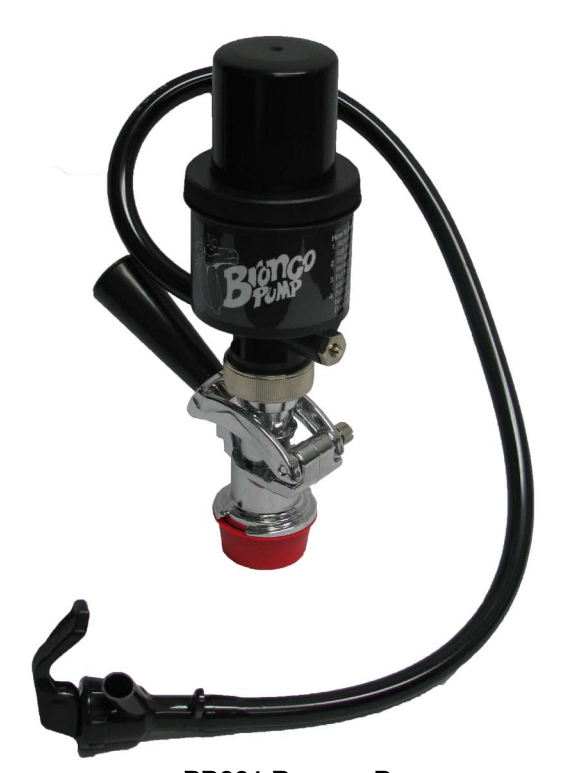
PP601 Bronco Pump Euro style also available PP602