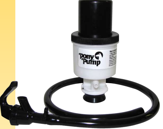
PP501 Pony Pump