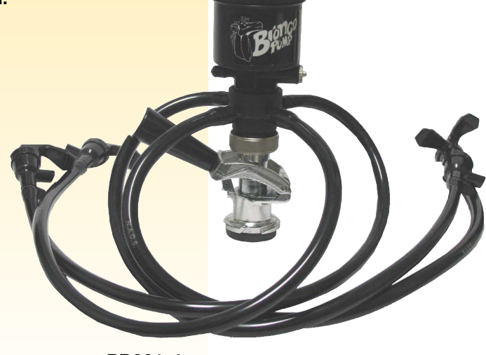
PP601-4 Bronco Pump