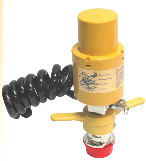
4097Q Gold Super Pump